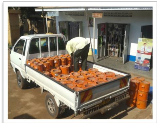
Figure 6: SESSA Delivery Truck

SESSA has also formed a new marketing strategy, which will leverage regional outlets as replacements to mobile sales teams and inventories. SESSA already has experience with this model, through its outlet in Mbale. The next branch will open in Gulu in early 2014. In