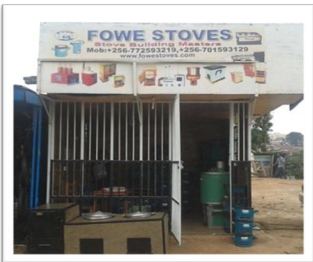
Figure 7: New FOWE Kampala outlet

addition to changes in sales methodology, SESSA will begin including novel sales offers and free stove trials for end users in an effort to prove charcoal savings. SESSA has also developed an aggressive growth plan that projects financial and sales data through 2020. In a testament to its ability to achieve this plan, SESSA has purchased three new trucks in line with the schedule. The trucks will be used to support the sales and distribution of regional outlets.