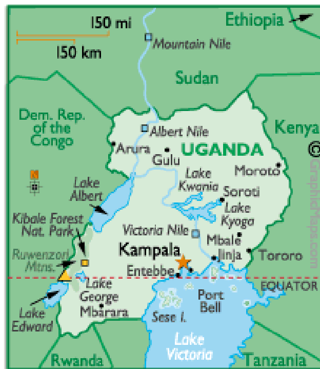
Figure 1: Location of Project Activity

The project boundary is defined as the kitchens used by the project population (ICS purchasers); this is distinct to the Reachable Fuel Collection Area, which is the geographical area of Uganda where fuel-wood can reasonably be expected to be collected throughout the period of the project.