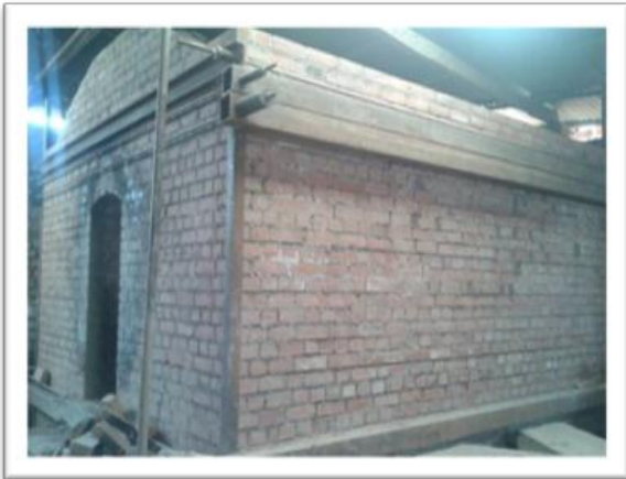
Figure 3: Ugastove kiln

Ugastove's Makindye factory reached its kiln's maximum production capacity and has used carbon revenues to invest in a second kiln on-site. The new kiln has an operating capacity of 4,000 liners per firing and facilitates improved liner quality, production, and inventory management.