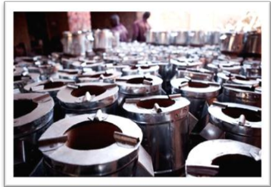
Figure 2: Ugastove charcoal stove inventory

Project manufacturers continue to prioritize stove durability and quality. Kitchen Survey results show that the Uganda Improved Stove model is widely recognized by customers as a stove that is durable and saves charcoal. Quarterly Kitchen Surveys demonstrate that stove users report overwhelming satisfaction with project stove quality, only 1 out of 61 respondents from this monitoring period said that they would not recommend their project ICS to a friend. Usage surveys also demonstrate that stoves last for longer than projected in the PDD as stoves are still being used beyond age five. No new stove design changes have been implemented during this monitoring period.