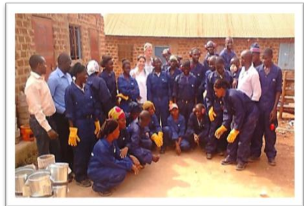
Figure 4: EUF workers in front of factory

Ugastove also won the Uganda Manufacturers Award of Energy Exhibitors in 2013 and was featured in the October 7, 2013 edition of The Daily Monitor newspaper. The award is given to the company that best works to conserve Uganda's natural environment. Ugastove won primarily as a result of its strong charcoal stove sales in 2013 and 2014 and resulting carbon emission reductions.