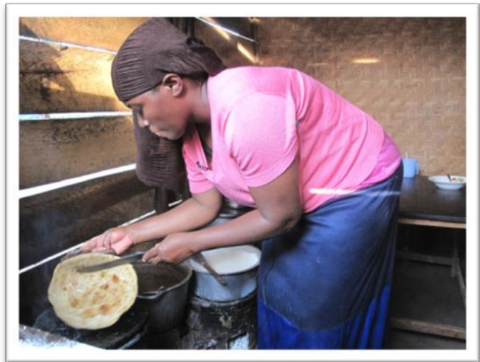
Figure 8: Commercial stove user cooks local dish chapatti

Livelihood of the Poor: The project's primary goal is to reach low-income families that normally cannot afford to purchase improved stoves. This project saves customers money in two phases: first, when they purchase the stove at a reduced price, and second when they continue to save money regularly on fuel. A major way in which this has been done previously is by subsidizing the manufacture and sale of high quality, long lasting and efficient stoves with carbon revenues wherein the project applies carbon revenues to operations, sales and marketing and production efforts in order to scale the business and reduce costs. These savings are directly passed on to the end user in the form of reduced prices, facilitating greater access to these stoves than would exist without carbon finance. The Project has not only done significant self-promotion of improved cookstoves, it has also developed partnerships with organizations who distribute the cookstoves to previously inaccessible regions such as Northern and Western Uganda. These partnerships have not only facilitated awareness of the importance of improved cooking, but have also provided access to areas that previously would not have had any opportunity to buy a stove.