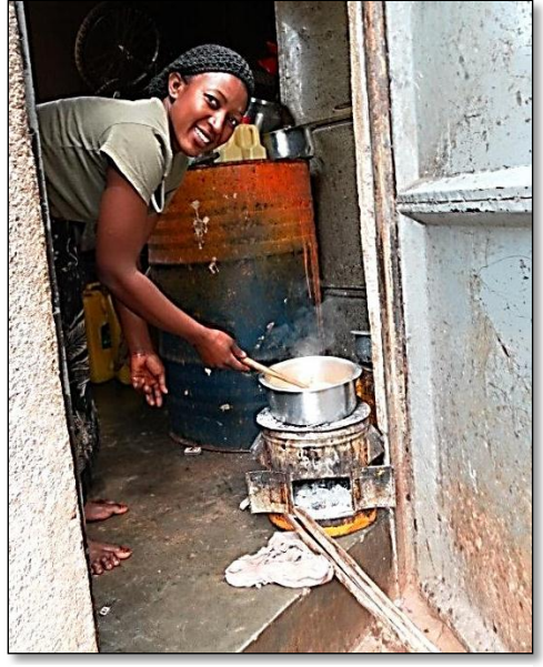
A Ugastove user tends her matooke. FINIK 1Apr12-31Dec12, GS Project 44/

the project applies carbon revenues to operations, sales and marketing and production efforts in order to scale the business and reduce costs. These savings are directly passed on to the end user in the form of reduced prices, facilitating greater access to these stoves than would exist without carbon finance. The Project has not only done significant self-promotion of improved cookstoves, it has also developed partnerships with organizations who distribute the cookstoves to previously inaccessible regions such as Northern and Western Uganda. These partnerships have not only facilitated awareness of the importance of improved cooking, but have also provided access to areas that previously would not have had any opportunity to buy a stove.