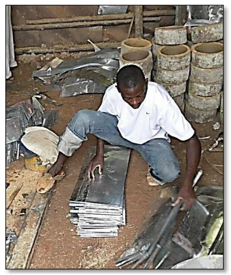
An EUF artisan prepares metal cladding.

Stove quality remains high. Ongoing Kitchen Surveys and Usage Surveys reveal that project stoves' breakage rates are lower than assumed by the PDD, and that the liners can last longer than the metal. As high quality liners facilitate efficient combustion, having a good liner is essential in creating public trust of improved stoves. Project