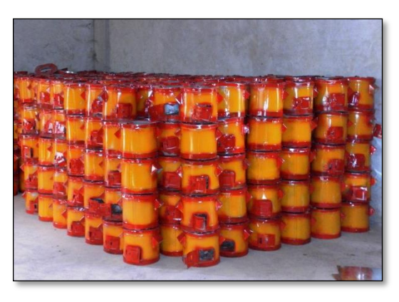
Uganda Improved Cookstoves