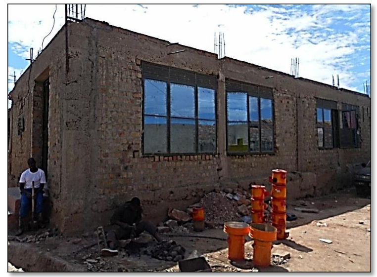
The Makindye factory's new storage space finished construction earlier in 2012.

The Makindye factory reached its kiln's maximum production capacity and has used carbon revenues to invest in a second kiln on-site, which is operational as of October 2012. This kiln has the ability to double production capacity. The factory also was able to allocate some carbon revenues toward expanding storage space to hold planned increased inventory – this is very important for protecting the stoves, especially during the rainy season. Storage has become increasingly more important as Ugastove expands its retailer relationships and creates a logistics system that facilitates efficient flow of inventory and timely deliveries.