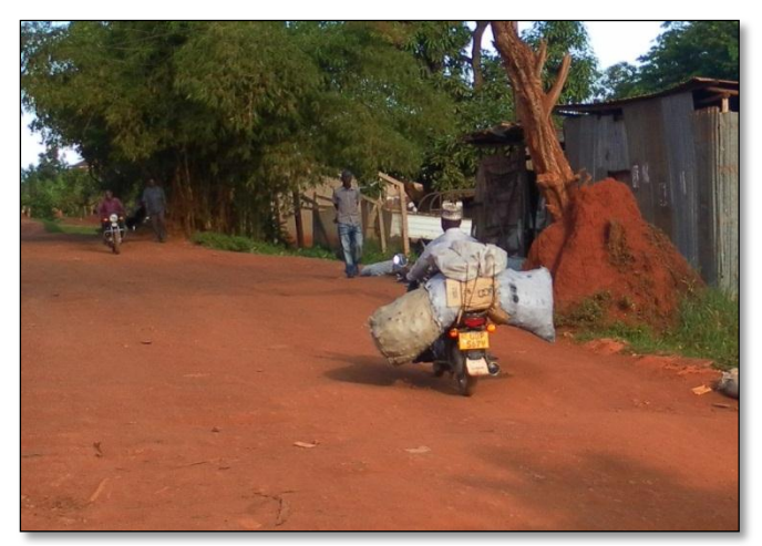
A motorbike rides away with a sack of charcoal.

Impact Carbon is committed to changing the household energy paradigm in Uganda from inefficient and unhealthy cookstoves to efficient, improved stoves. Achieving this shift on a national scale requires sustained marketing campaigns, stove subsidies financed by advanced carbon payments, and creating comprehensive and far-reaching partnerships between improved stove manufacturers and distribution networks.