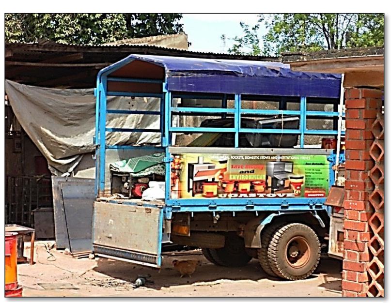
Ugastove's truck is just one part of a comprehensive marketing plan that increases sales. This truck not only holds inventory and transports stoves, but also markets the project's brand to consumers.

The tables below summarize the updated values of all the monitored parameters as defined in the PDD's monitoring plan. The source of each value is given in the table, and the relevant reports are in separate files appended to this document. These parameters were initially assessed in the Baseline Study and KPTs which were first performed beginning in 2006, completed in 2008 and validated upon project registration. Parameters measured every two years did not require resampling this verification, according to the applied methodology. Project baseline fuel consumption factors were updated during the 2010 KPT