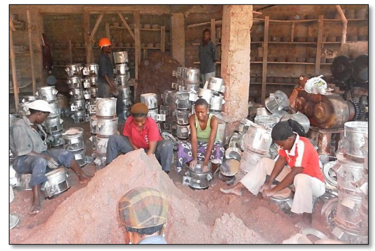
Ugastove's ceramics team, comprised of mostly women, prepare the stove fireboxes and add insulation.

Livelihood of the Poor: The project's primary goal is to reach low-income families that normally cannot afford to purchase improved stoves. This project saves customers money in two phases: first, when they purchase the stove at a reduced price, and second when they continue to save money regularly on fuel. A major way in which this has been done previously is by subsidizing the manufacture and sale of high quality, long lasting and efficient stoves with carbon revenues wherein