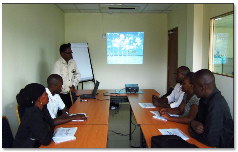
Factory representatives attend a Traidlinks meeting.

developed by accounting experts in partnership with a small-business expert with an MBA from Presidio School of Management in San Francisco, California. This tool has been used by manufacturing partners since 2010; it allows subsidiary manufacturing locations to collect the same information as the Makindye factory, including sales, production, and labour, without having to invest in expensive QuickBooks software. This recordkeeping tool helps manufacturers be able to better understand their business operations and make informed decisions. It also facilitates robust