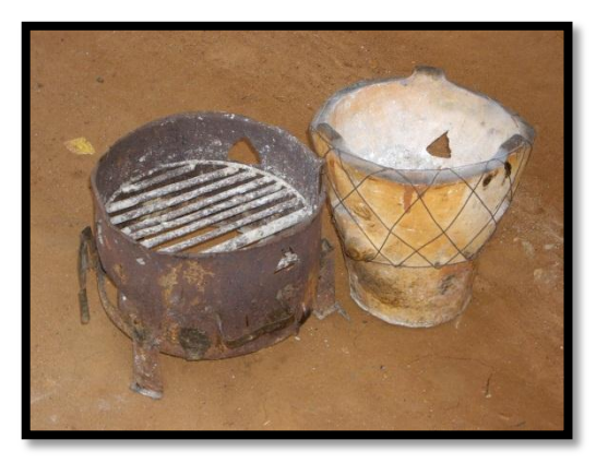
Traditional and Inefficient Unimproved Sigiris

Submitted by Impact Carbon with assistance from Climate Care and Local auditing by CIRCODU